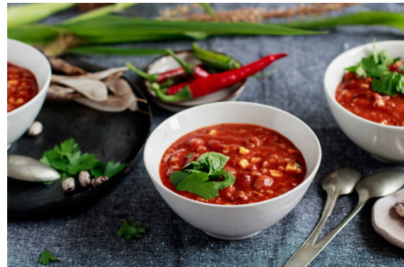
Vegetarian chili can help keep you warm and healthy this winter.