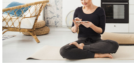
A new mindfulness training app called Wakeful is currently being piloted.